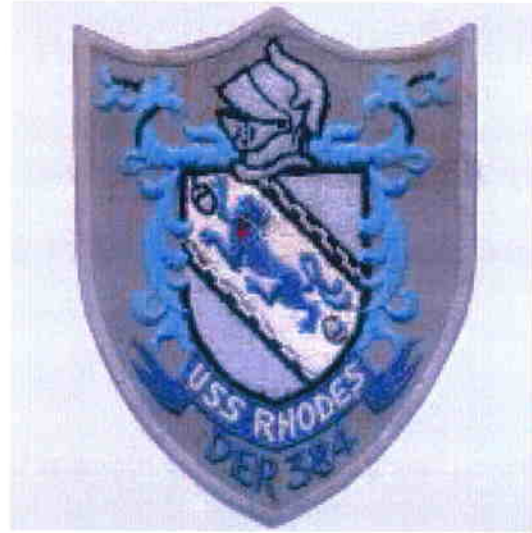
Ship's patches