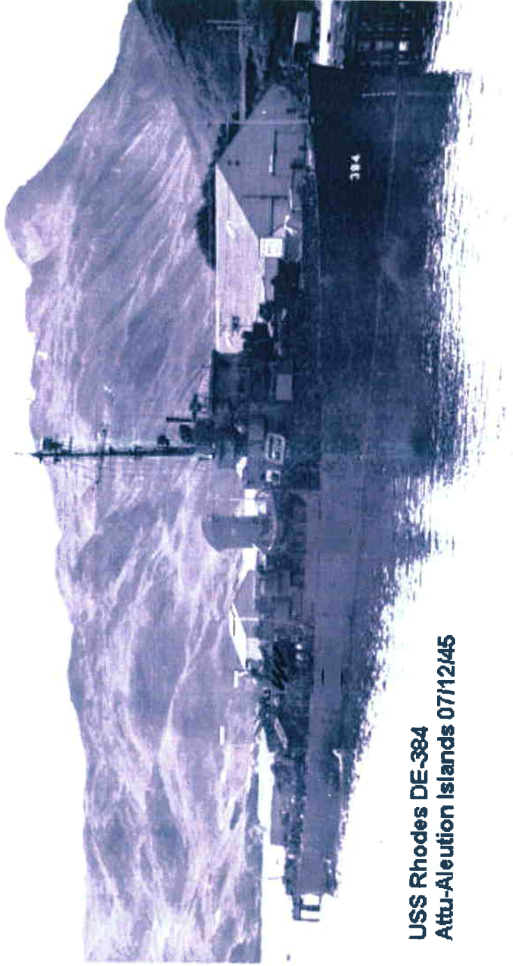
USS Rhodes DE-384 Attu-Aleutian Islands 07/12/45